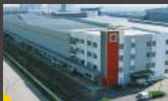
Senheng Logistic CDC 6.58 acres