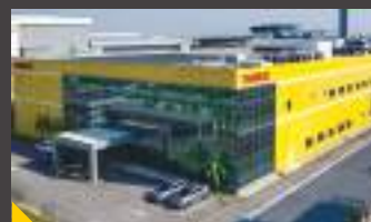
FANUC Mechatronics 4 acres

Give your business the X-tra edge at BBRX Business Park