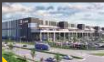
E-Metro Logistics Park 177 acres

Some of the renowned industrial businesses located within Bandar Bukit Raja.