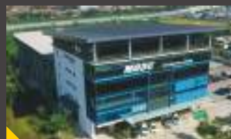
Modu System 5.32 acres