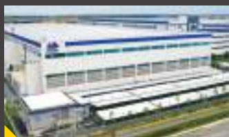
Vinda Malaysia (SEA HQ) 27 acres