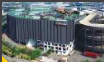
CJ Century Logistics 12.26 acres