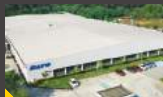
SATO 14 acres