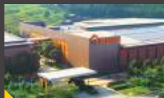
Big Dutchman Malaysia 18.94 acres