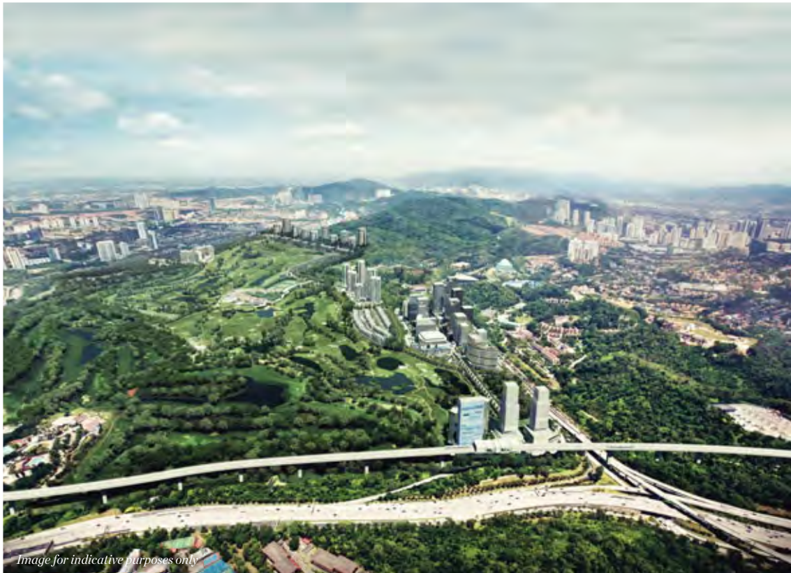
Image for indicative purposes only

Where you live dictates how you live. Located in the pristine landscape of Bukit Kiara and 8km from the heart of Kuala Lumpur, Alya combines its unique 360 acre natural setting with well-planned architecture and spaces. World-class amenities such as TPC Kuala Lumpur, Southeast Asia's number one golf club, are available right at your doorstep. Alya offers exquisite urban living amidst the serenity of nature.