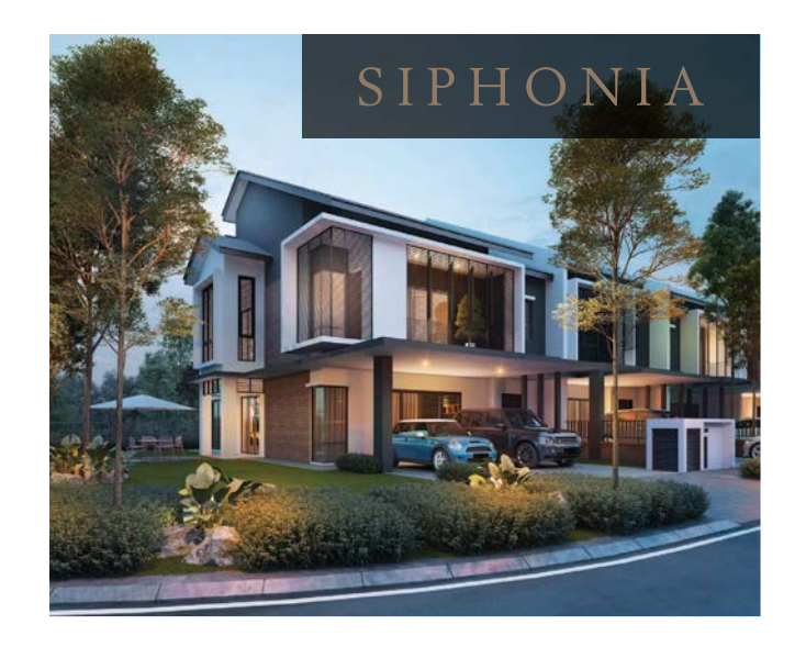
Type: 2 Storey Superlink Homes