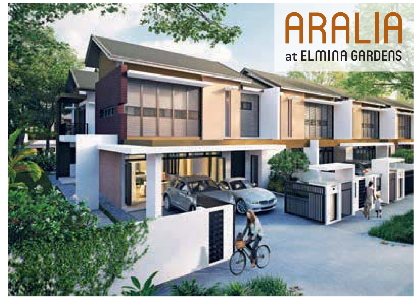
Type: 2 Storey Superlink Homes