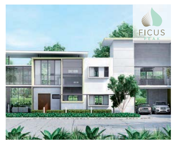
Type: 2 Storey Semi Detached Homes