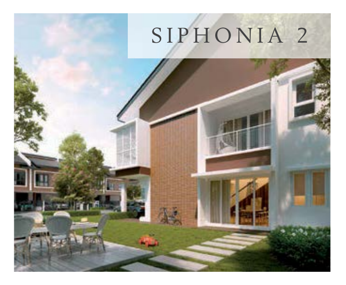
Type: 2 Storey Superlink Homes