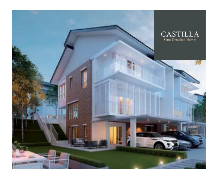
Type: 3 Storey Semi Detached Homes