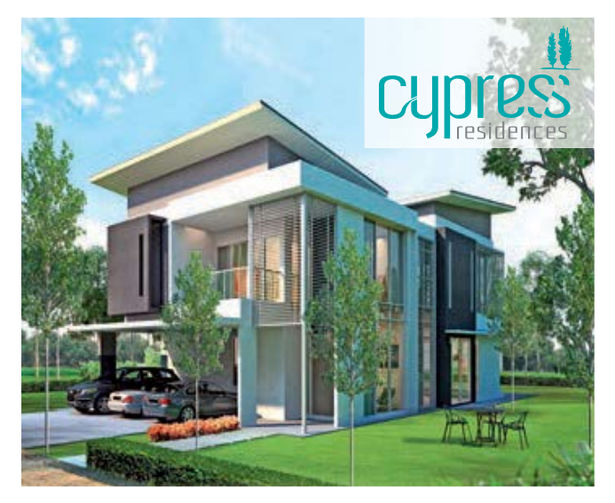
Type: 2 Storey Bungalow