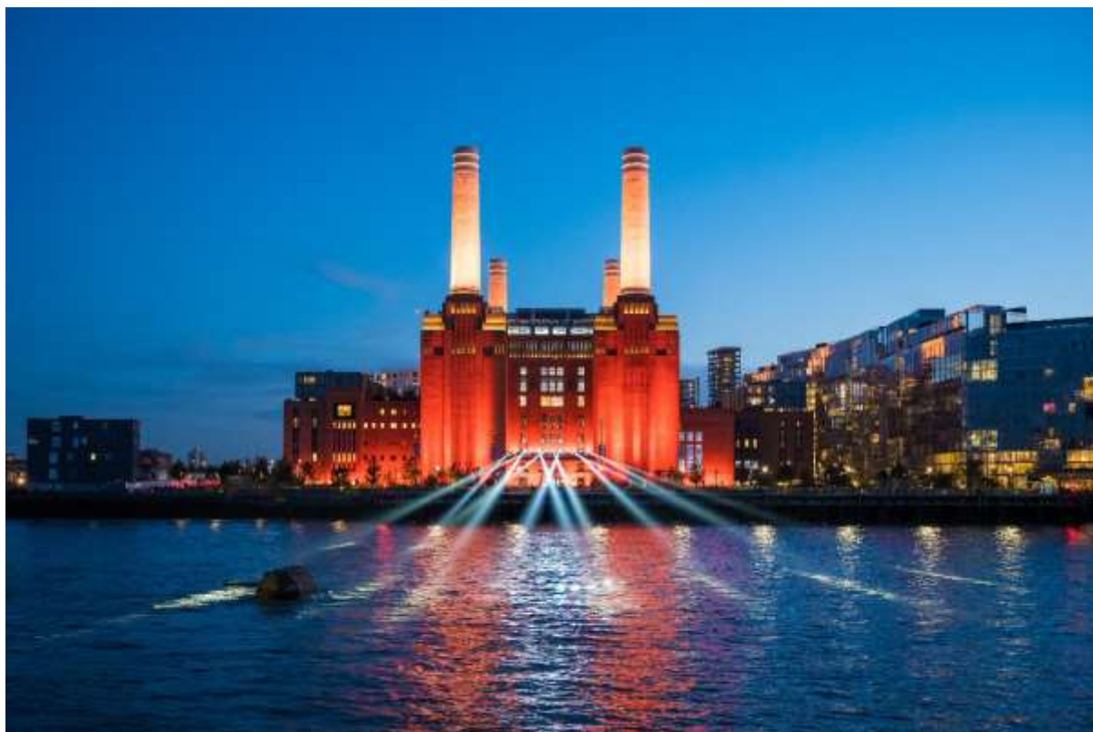
Caption: Battersea Power Station lit up for its grand public opening.

Under Embargo until 0:01 14 th October 2022